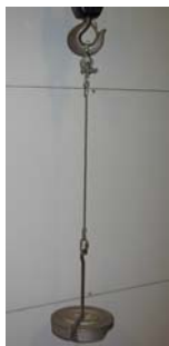
Figure 1, Simulating Strap Tension

When calibrating instruments use lb weights values only. (For optimum accuracy use weights traceable to National Standards.)