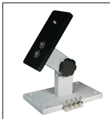
Optional AC1008 tabletop mounting stand