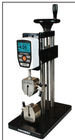
Shown with an ES20 test stand and G1061 wedge grips